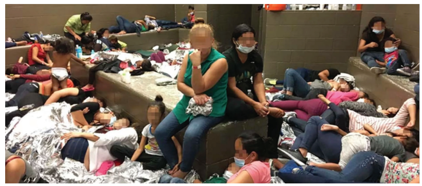
Asylum seekers in Border Patrol detention at Weslaco, Texas.