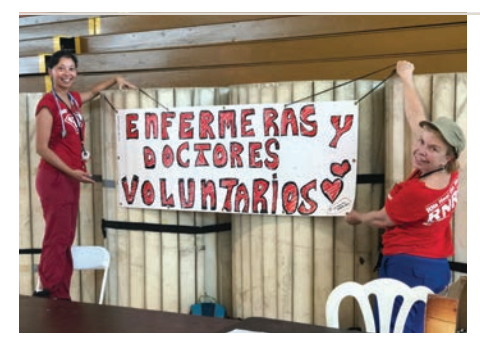
RNRN volunteers on various deployments.

The Registered Nurse Response Network, a disaster relief program sponsored by National Nurses United and California Nurses Foundation, has a volunteer base of more than 26,000 RNs representing all U.S. states and territories as well as 21 countries around the world. RNRN volunteer nurses have cared for thousands of patients during disaster relief and humanitarian assistance deployments that include the South Asian tsunami (2004); Hurricanes Katrina and Rita (2005); the Haiti earthquake (2010); Super Typhoon Haiyan/Yolanda (2013); Continuing Promise with the Department of Defense (2010, 2015); Hurricanes Harvey and Maria (2017); Volcan de Fuego relief in Guatemala (2018); Hurricane Michael (2018); the Camp Fire in Butte County, Calif. (2018); and the Arizona border to provide medical care to asylum seekers (2019).