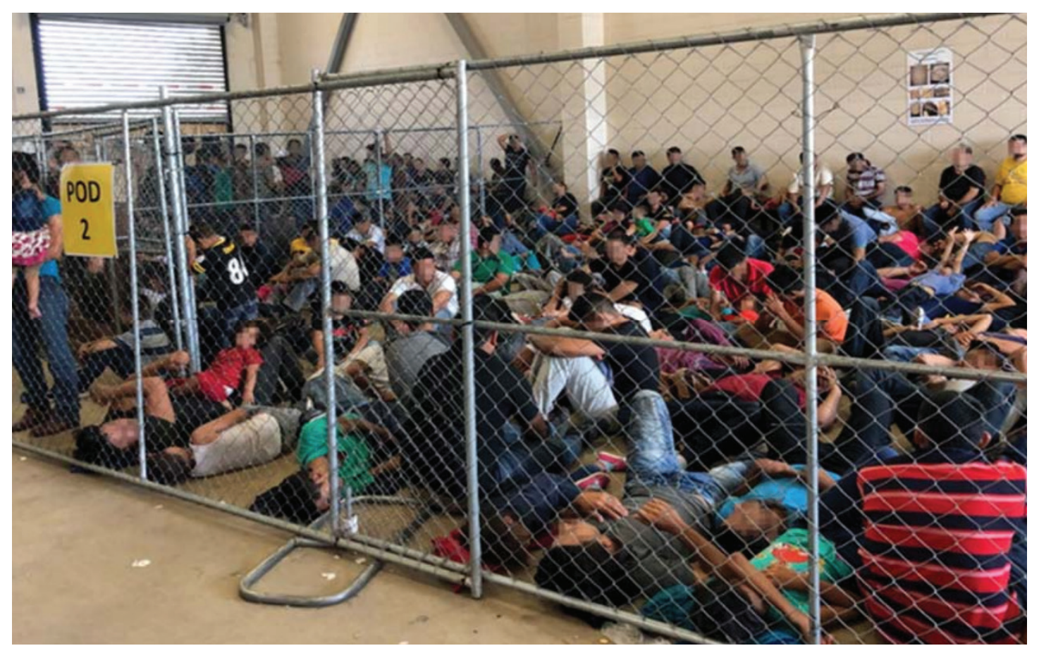
Asylum seekers in Border Patrol detention at McAllen, Texas.

Nurses saw the effects of adults and children having necessary medications confiscated and destroyed by ICE and/or Border Patrol agents, including those needed for blood pressure and heart conditions, to lower cholesterol, as well as asthma and anti-seizure medications. Nurses also got reports of bottles and formula being taken away from bottle-fed babies and their mothers. RNRN volunteers also saw the physical and emotional trauma experienced by the asylum seekers during their time in U.S. custody, and its potential for long-term adverse implications on asylum seekers' health and well-being.