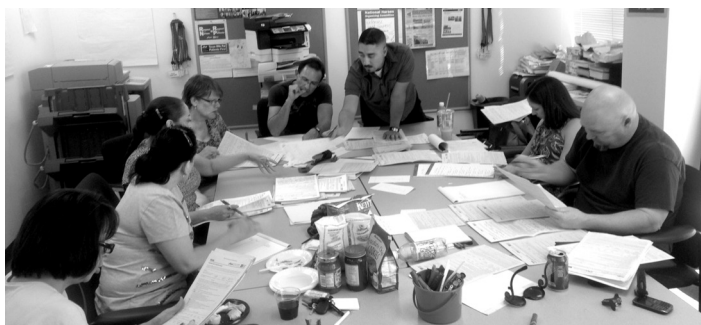
The scene of action shifts from Houston to El Paso as Tenet nurses there make plans to complete contract negotiations. Pictured here are some of the members of the Joint Action Committee making their plans in the union office.