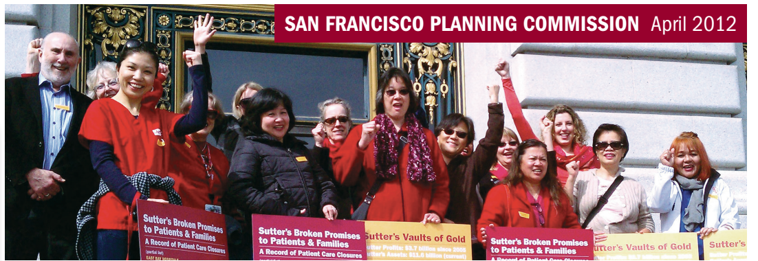
SAN FRANCISCO PLANNING COMMISSION April 2012