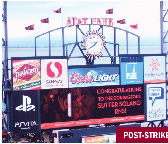
POST-STRIKE May 3, 2012